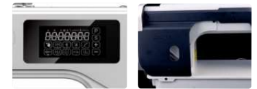
高清触控大屏 Hd touch large screen