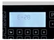
保养提醒，有效提升机器寿命 Maintenance reminder, effectively improve machine life