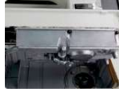
密封油箱：省油，工作环境更干净 Sealed fuel tank: saving fuel, Cleaner working environment