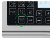
快捷方便，一键恢复出厂设置 Fast and convenient, one key to restore factory Settings